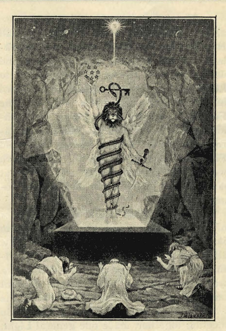
The Resurrection of Mithras.