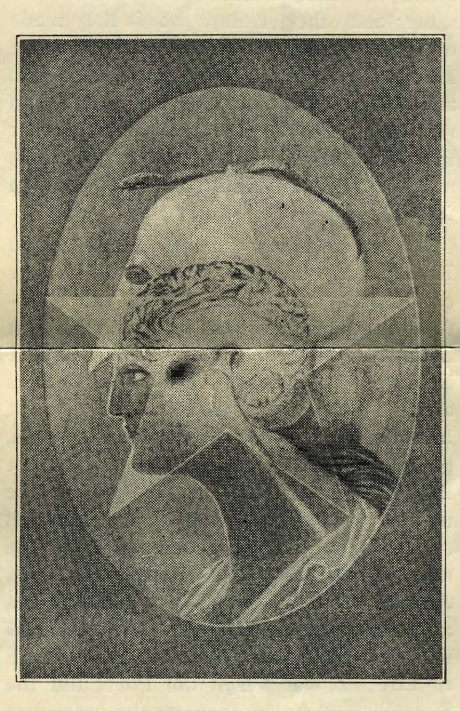
THE OPENING OF THE THIRD EYE

All beautifully printed in four colors with discription of Occult principles involved.