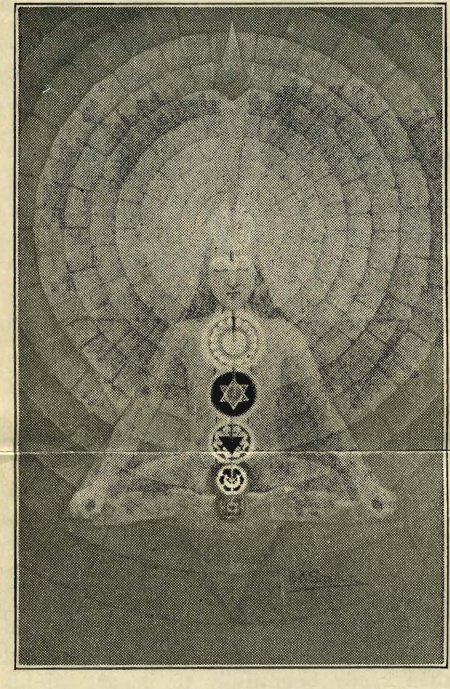
THE SEVEN SPINAL CHAKRAS

All beautifully printed in four colors with discription of Occult principles involved.