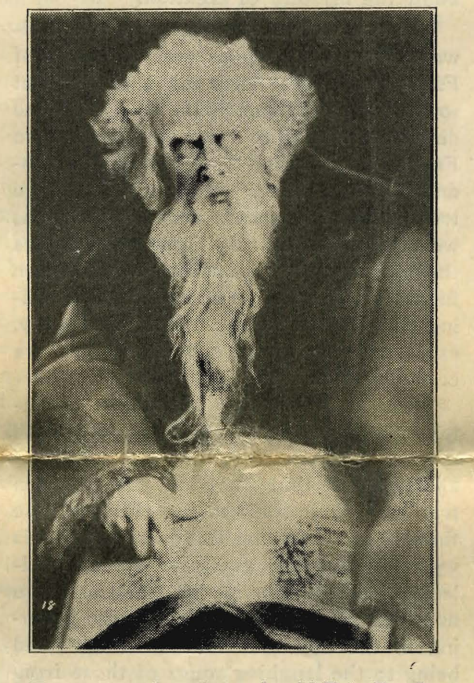
Faust, as played in the UFA Production, now playing at Figueroa Theatre. It is worth while-see it.