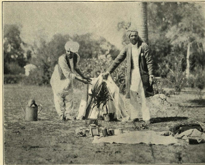
Growing the Mango Tree

The young man told me that upon one occasion he retired into the foothills of the Himalayas for a two-year period of meditation and renunciation.