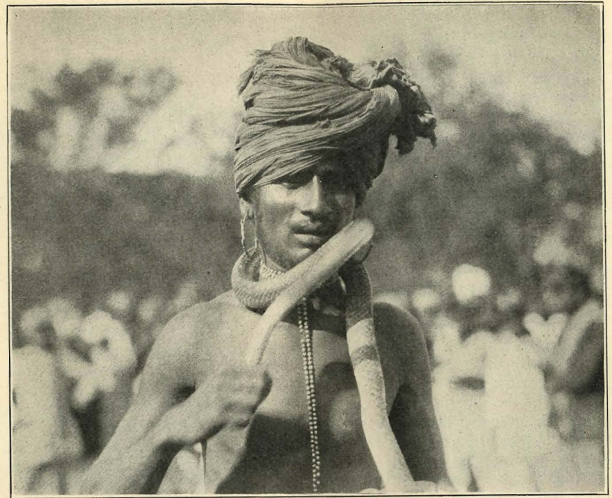
A Hindu Snake Charmer

While wandering in the grounds of the Victoria Memorial building we met the interesting personage whose photograph accompanies this article. When first seen, he was sitting down, surrounded by his snakes and a troupe of small boys, the latter as irrepresible in India as in America. Noting the approach of a white man, which meant money, the Hindu prepared his performance. Motioning the boys to keep back, he stood up, his skin gleaming like copper in the humid Indian sunlight. His clothing consisted of a varicolored turban and a rag about his loins. He motioned to a young Mohammedan who stood nearby to loan him his slipper, and the youth with a laugh