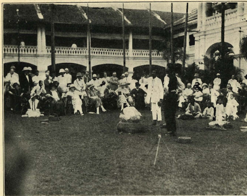
The Boy in the Basket Trick

In the grounds of the Raffles Hotel in Singapore we saw one of the finest demonstrations of Oriental magic. We made a desperate effort to photograph the various tricks, but the failing light—for magicians prefer to work in the