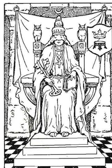
2 LA PAPERSE 2

Socrates was a philosopher of the streets who believed that by analyzing the chemistry of human relationships he could discover the solution to the riddle of life. His temple was the Forum, his school the market-place, and the subject and object of his every conclusion—Man.