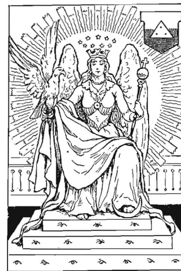
3 L'IMPERATRICE 7

A good New Year's resolution would be to use time wisely, to get out of every minute a full sixty seconds. At the same time that we are emptying the minute of its potentialities, we can be filling it with ripe accomplishment, making each minute full of experience, thought, and action. When we accomplish this, we are almost certain of a Happy New Year.