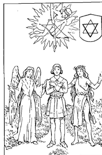
6 L'AMOURAUX 7

This special deck of Tarot cards, beautifully and artistically done in full colors by J. Augustus Knapp (who so ably illustrated Mr. Hall's monumental work on Symbolical Philosophy), contains not only the distinctive features of all preceding decks but additional material secured by Mr. Hall from an exhaustive research into the origin and purpose of the Tarot cards. For convenience the Tarot cards have been printed in the size and style of standard playing cards. A 48-page explanatory brochure by Mr. Hall accompanies each deck. Postpaid $3.00.