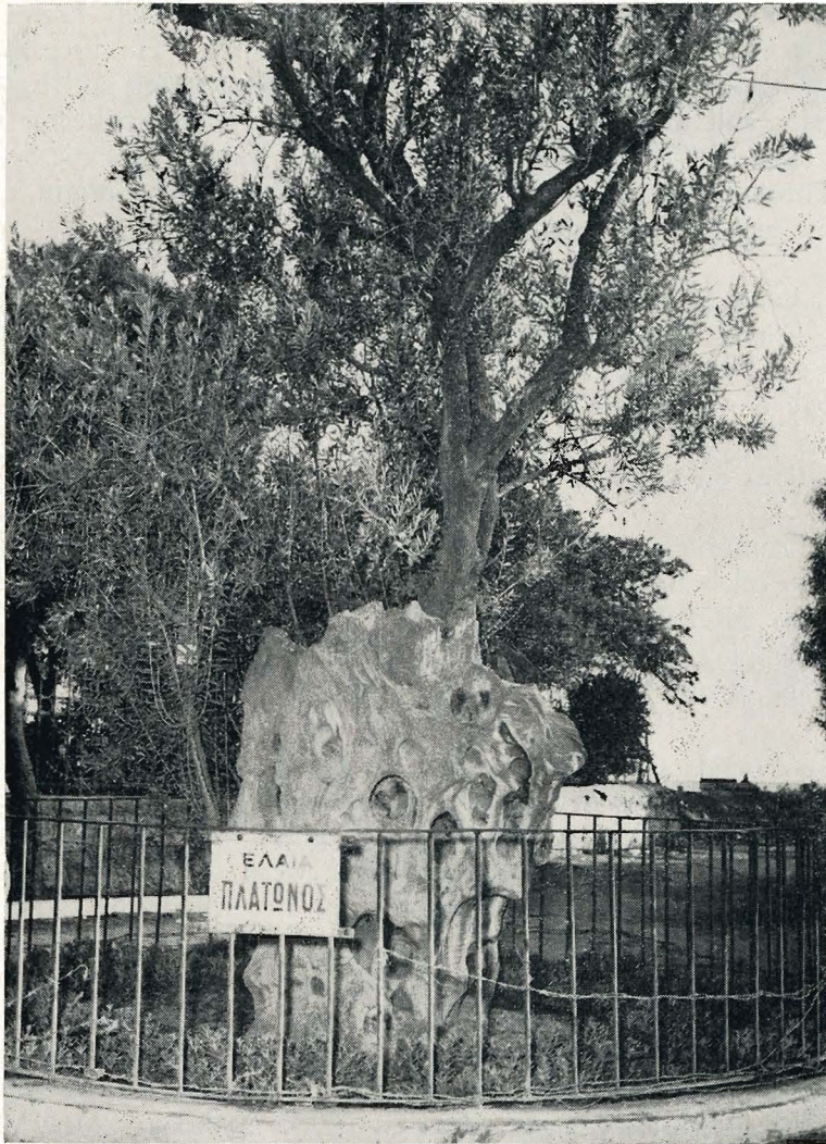
PLATO'S OLIVE TREE

Through the kindness of a friend who attended the recent Pythagorean festival in Greece, we are able to reproduce herewith a photograph of the Olive Tree under which Plato taught his disciples more than 23 centuries ago in Athens. It is interesting and significant that from the ancient trunk a live tree is growing, which may well symbolize that the teachings of this great philosopher live in the modern world as a constant source of enlightenment and inspiration.