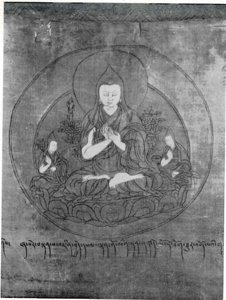
PLATE III TSONG-KA-PA

The other attributes as represented on this image emphasize the principal doctrines with which Padma Sambhava is identified. The plume in his crown rises from a half-dorje and is a vulture's feather, recognized in this system as suggesting the heights of aspiration. The guru's headdress is called a lotus cap , and the lappets which would normally fall over his ears are turned back to signify his attentiveness to the supplications of his devotees. The right hand, holding the dorje, also includes a mudra intended to represent victory over, or protection against, forces of darkness and evil. Padma Sambhava is often