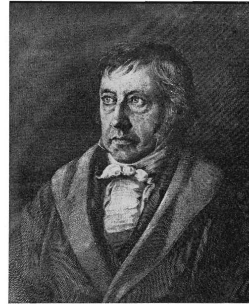
GEORG WILHELM FRIEDRICH HEGEL

In spite of Hegel's personal peculiarities, or perhaps because of them, his philosophy, known as Hegelianism , exercised a powerful influence upon the German mind of the 19th century. Hegel's attitudes on religion are typical of his involved mental processes. There is a legend that he once remarked: "Only one person in the world understands me, and he does not." Hegel's respect for the life and teachings of Jesus was profound, and throughout his life this German philosopher was deeply concerned with the spiritual mystery at the source of life. Broadly speaking, he attempted to reconcile the ontolog-