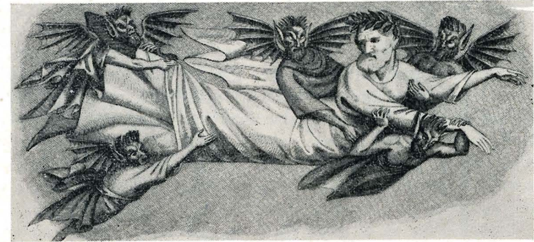
SIMON MAGUS SUPPORTED IN THE AIR BY DEMONS

The most fantastic of the many legends concerning Simon is contained in the apocryphal "Acts of the Holy Apostles Peter and Paul." The origin of this work is uncertain. Some parts are considered to be early, others are most certainly comparatively late. A translation of a portion of this apocryphal book appeared in 1490, and Dr. Tischendorf examined six manuscripts, the oldest of which dated from the 9th century. We may therefore have certain reservations concerning the authenticity of this account, not only because it was probably compiled after the legend of Simon had passed through numerous cycles