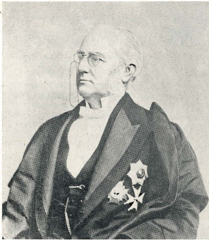
FRIEDRICH MAXIMILIAN MUELLER

Photograph taken on the occasion of his 50th anniversary as Doctor in the University of Leipzig.