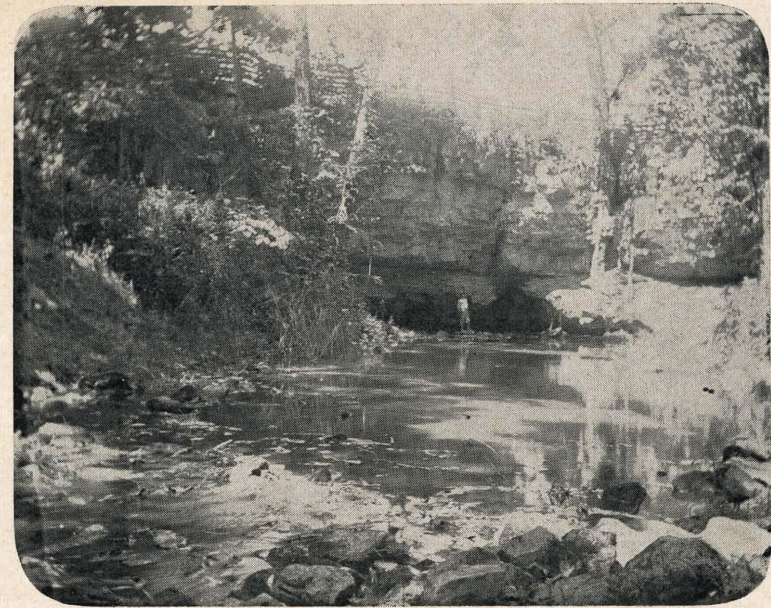
THE CAVE OF ETIDORHPA