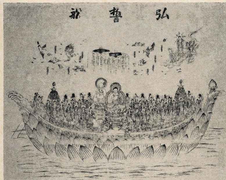
THE SHIP OF THE GREAT VOW

The Nembutsu doctrine emphasizes the importance of the repetition of the words "Namu Amida Butsu," which can be translated, "Adoration to Amida Buddha." The same statement is also