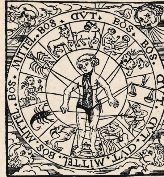
Early woodcut showing the relationship between the signs of the zodiac and the parts of the human body.

The cultivation of an adequate philosophy, constructive and creative interests, vital hobbies, and good music contributes to the peace of soul of the Scorpio native. His health generally is not robust. He frequently suffers from constitutional or chronic ailments which do not respond completely to treatment, and constitute a continuing drain upon vital reserves. Moderate living, adequate rest, and a reasonable degree of social life will help to protect a fair level of physical efficiency. The eyes may give trouble. There may be some deformity or difficulty with teeth, and there is susceptibility to infection. Ailments of the generative system are also a possibility. Both men and women born under this sign have a tendency to hysteria, but this lessens after middle life. Marital relationships are often unfortunate, and may contribute to nervousness and personality stress. The religious needs