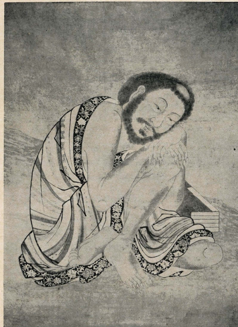
BUDDHA AS MENDICANT

Although the Buddha-image is magnificently expanded in the Mahayana Doctrine, until it seems to become identical with the God-concept of Western man, the Shinshu sect makes the following clear and impressive statement: "It is not because there is a Buddha that humanity exists. It is because humanity exists that there is a Buddha." Truly, if there were no human being with a human mind, there could be no Amida Buddha. Thus, the Buddha Amitabha, seemingly invested with all the attributes of a deity, is really the flowering of man's own humanity. He personifies man as the enlightener of man, the redeemer of man, and the dedicated servant to the needs of man. He is that man of in-