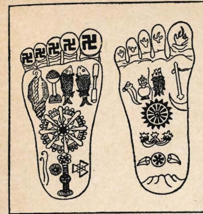
Tracings of the footprint of Buddha from ancient stone carvings. Chinese origin. Sacred Buddhist emblems associated with the identification of a perfectly enlightened being.

Buddha was said to have been born with sacred marks upon various parts of his body. From these, the soothsayers in his father's court prophesied his divine ministry. Certain important signs are said to have been placed by nature, or the Will of Heaven, upon the soles of his feet. Fortune-telling by the lines on the feet was anciently practiced in Asiatic countries. I remember discussing this once with the celebrated palmist Count Louis Hamon (Cheiro).