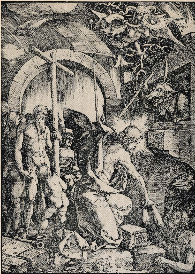
CHRIST IN LIMBO

From "The Great Passion" by Albrecht Durer