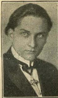
MANLY P. HALL

Printer, Platemaker and Artist Pronounce It Unique