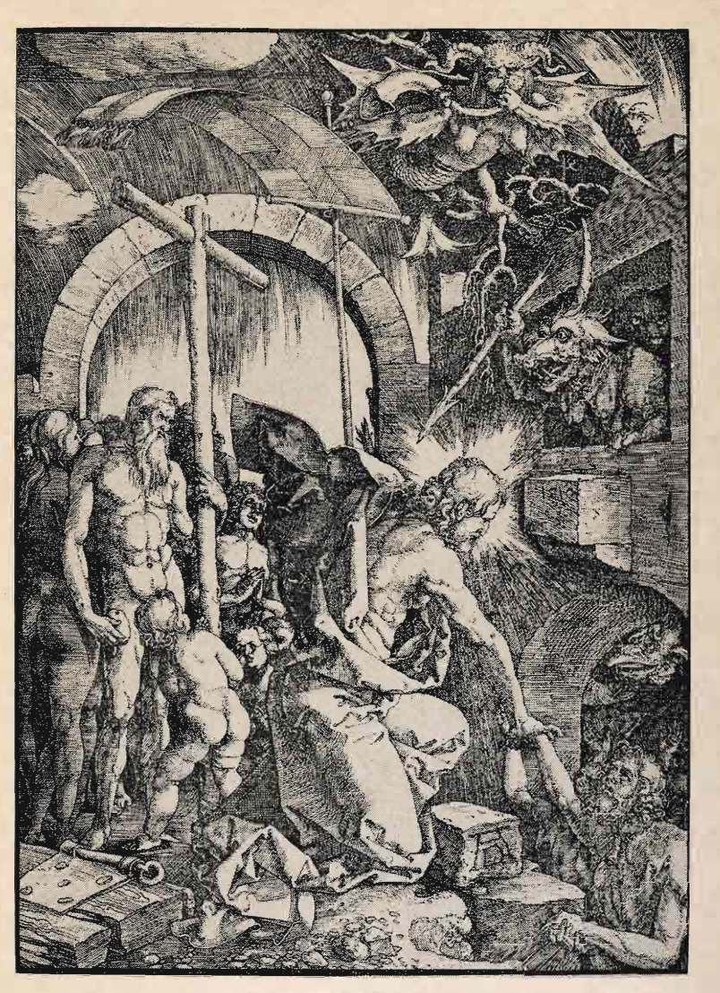
CHRIST IN LIMBO From "The Great Passion" by Albrecht Durer

seed which was planted in every human heart. This is the Christ seed, which must be guarded and nurtured, warmed by the sun of dedication, made fertile by the water of purification, so that finally it will grow into a great tree, and the fruits of this tree are for the healing of all wounds and all sorrow and all pain. By the practice of the presence of God in daily living, we make the Tree