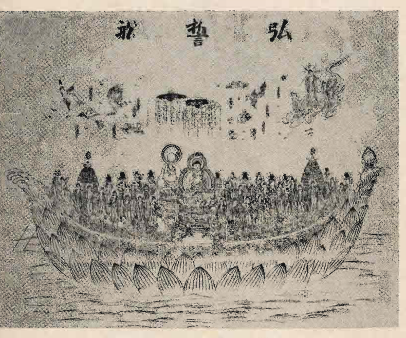
THE SHIP OF THE GREAT VOW A Japanese version of the Ship of the Doctrine according to Mahayana Buddhism. A woodcut by Koseisen, formerly in the William Bateson Collection.

found in the Chinese Mahayana sect, and is used in the identical way. The Nembutsu is an essential part of the teaching of the Pure Land. There is little merit, however, in the mere repeating of the words. The formula must cause a quiet, thoughtful experience of the meaning of the mystic salutation. There must be a total acceptance of the Amitabha power. It must be known as an indwelling image, continually intensified by contemplative procedure. To the Amidists, the Nembutsu is the prayer which causes the lotus seed of salvation to fall into the pool of the Western Paradise, and which assures the entry of the believer into Amida's Blessed Land. (See Part II, Autumn 1961, page 60).