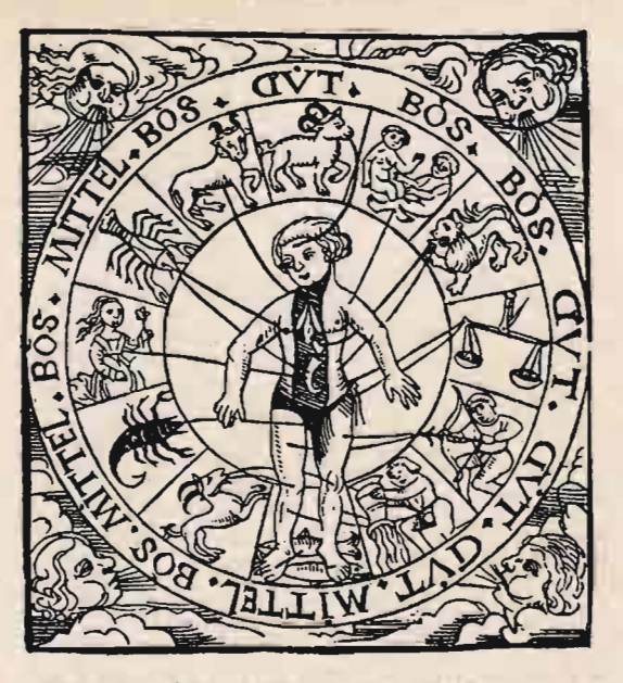
Early woodcut showing the relationship between the signs of the zodiac and the parts of the human body.

The cultivation of an adequate philosophy, constructive and creative interests, vital hobbies, and good music contributes to the peace of soul of the Scorpio native. His health generally is not robust. He frequently suffers from constitutional or chronic ailments which do not respond completely to treatment, and constitute a continuing drain upon vital reserves. Moderate living, adequate rest, and a reasonable degree of social life will help to protect a fair level of physical efficiency. The eyes may give trouble. There may be some deformity or difficulty with teeth, and there is susceptibility to infection. Ailments of the generative system are also a possibility. Both men and women born under this sign have a tendency to hysteria, but this lessens after middle life. Marital relationships are often unfortunate, and may contribute to nervousness and personality stress. The religious needs